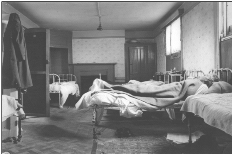
Sleeping arrangements at the Granville. Volunteers and residents shared rooms.

Most of the residents were alcoholics, though the house itself was 'dry' (in other words, drinking was not allowed on the premises). Workers were therefore required to frisk people on entry for bottles. However, this was not a foolproof method of keeping drink out: "The captain of the Salvation Army once saw a man walk up to the house and throw a pebble at a window on the first floor. A rope was lowered and a bottle carefully tied to it; this was hoisted up and the man knocked on the door, to be duly 'frisked' before being let in!" 4