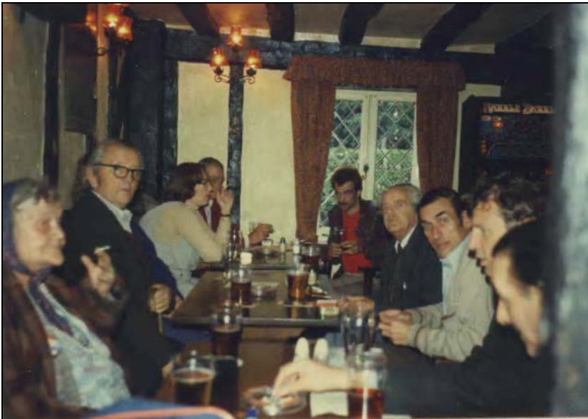
Residents and staff relaxing together at a pub near Short Street, early 1980s.

Day trips and outings were also a part of life, with trips to the seaside fondly remembered by residents and volunteers alike.