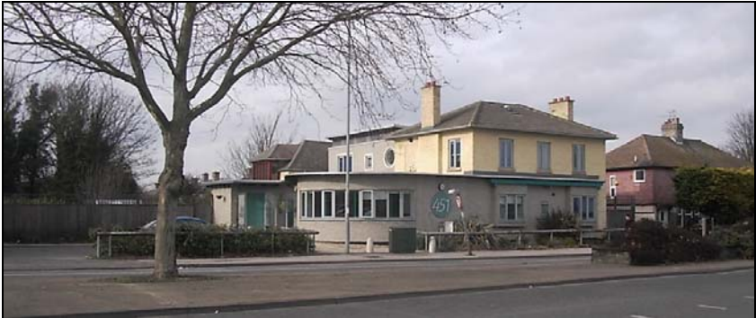
The Controlled Drinkers project, Newmarket Road, opened in 2006.

dilapidated premises and a lack of funding. However, 30 years of campaigning efforts had increased public awareness and seen greatly improved funding arrangements. The Council now accepted a responsibility towards this group and the Cyrenians were now a professional and experienced organisation capable of taking on the challenge.