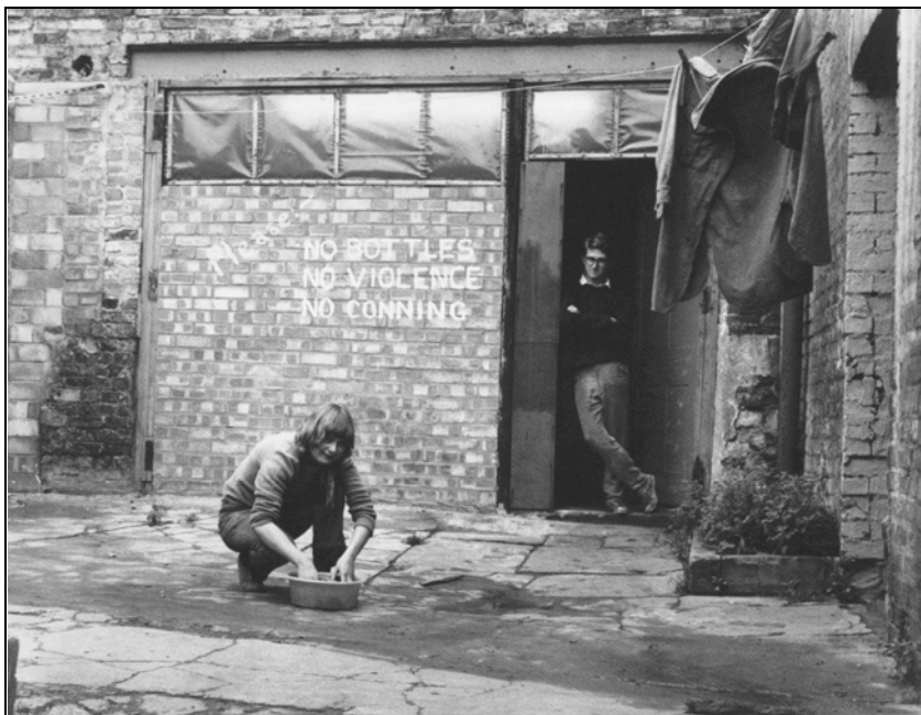
The Shelter in the back yard of the Granville with volunteers washing up. The writing on the wall reads "Please! No bottles. No violence. No conning".

A soup kitchen opened at 6pm and the sheds, which acted as rather austere dormitories for men only, were available from 7.30pm until 7.30am.