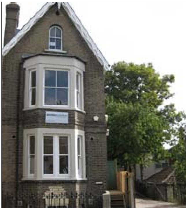
Overstream House, new home of the 'Bus'.

.WinterComfort had grown rapidly since its inception and now had an army of over 200 volunteers, as well as the house in Victoria Avenue to use. It was therefore agreed that they should take over the running of the Bus entirely. In October 1993 the staff were transferred across to WinterComfort and in January 1994, the Bus Project was moved away from the Lion Yard to Overstream House, in Victoria Avenue (see above). The Cyrenians focused instead on what they felt they did best, running their group houses.